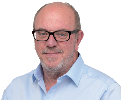
Sir David Nicholson KCB CBE, Chairman

We will also take the opportunity to tell you a little bit more about your new acute hospital, the Midland Metropolitan University Hospital, which opens in Smethwick next year.