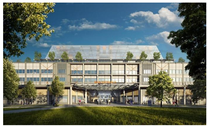
The Midland Metropolitan University Hospital, due to open in 2024

Your Trust Charity's minimum £2 million We Are Metropolitan fundraising campaign - of which over 75% has been banked to date - will make this more than a hospital. Our campaign will fund those things over and above core NHS funding, which will enhance our hospital's ability to deliver exceptional care in a world class building.