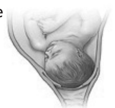
Cervix stretching around baby's head

When you reach the end of your pregnancy it is normal to feel apprehensive or even excited about the start of labour. Before labour starts, the neck of the womb (cervix) is long, firm and closed but this changes in the last few weeks of pregnancy.